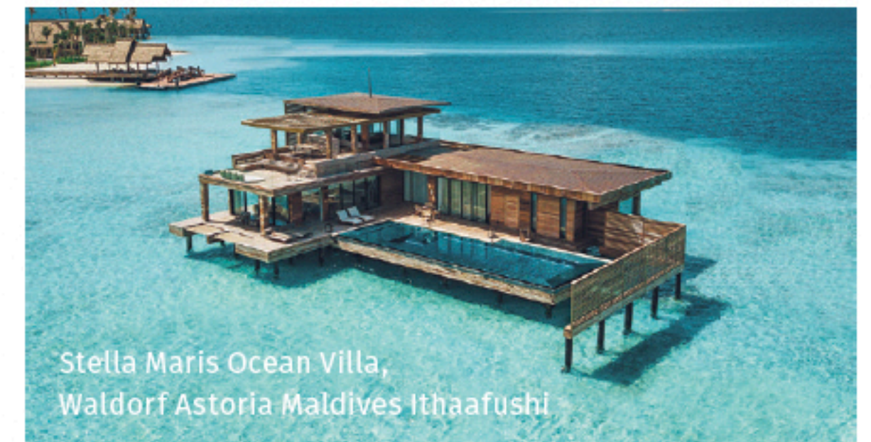
Stella Maris Ocean Villa, Waldorf Astoria Maldives Ithaafushi