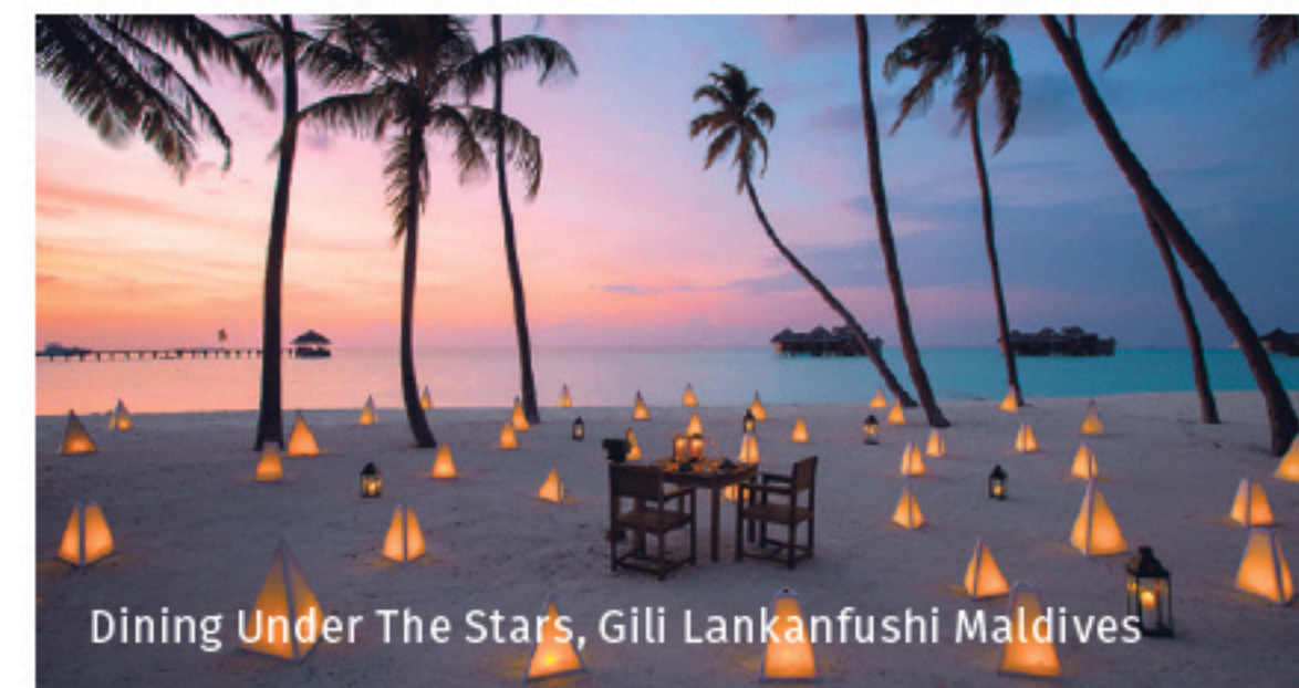
Dining Under The Stars, Gili Lankanfushi Maldives

Amazing Escapes opens the door to this oceanic wonderland and makes bucket-list dreams a reality. Discover iconic overwater villas, where the turquoise ocean